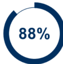
Year to Date (2020)

Every day matters! Our goal is 95% or higher!!